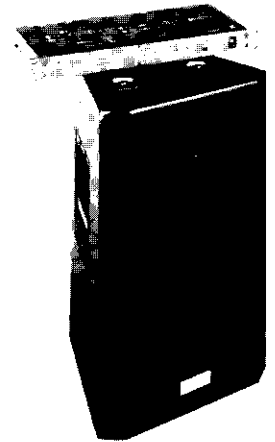
FIGURE 2 — DML-1122A speaker system with companion controller.

It should be stressed that this technique is not a substitute for good fundamental loudspeaker system design. The additional expense required to do a system of this type should not be secured by skimping on the acoustic components and then attempting to make the result more survivable. The intent should be to make pieces of fine machinery even more valuable when the circumstances warrant. The words "expense" and "value" should perhaps be expanded upon as their implications are not necessarily obvious.